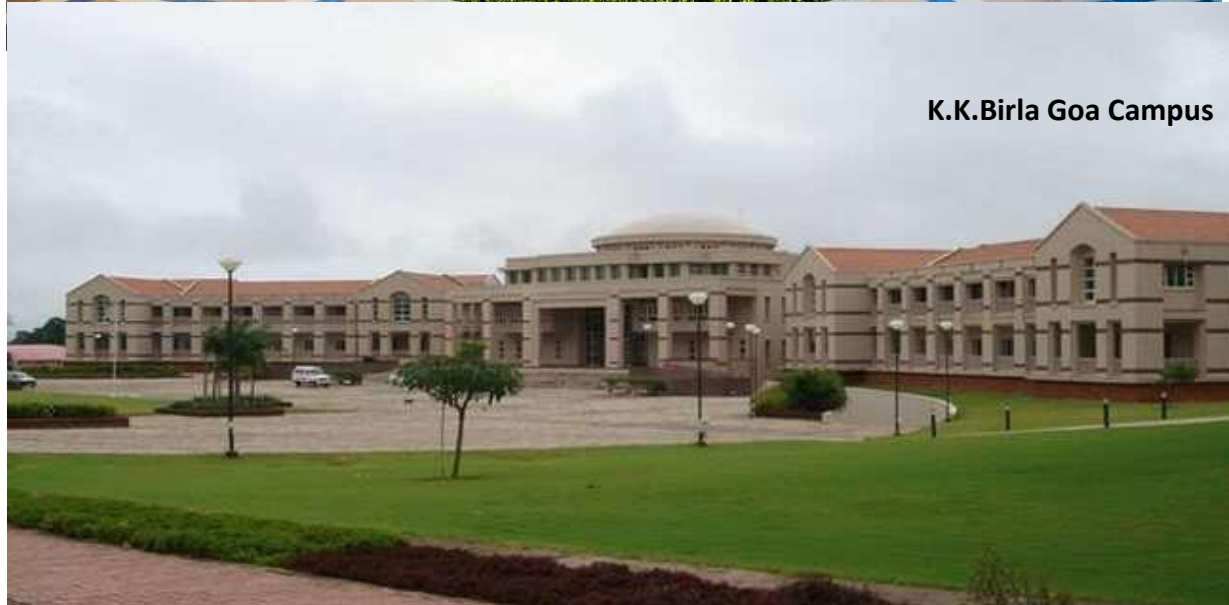
K.K.Birla Goa Campus